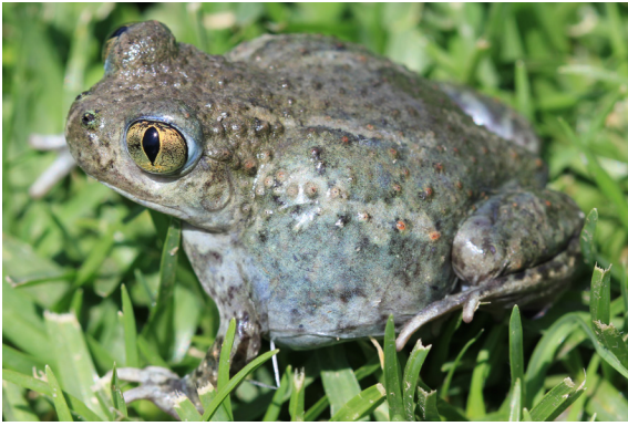
Fig. 1. Spea multiplicata male observed in an urban habitat in Metepec, Estado de México, Mexico.

of the Mexican Spadefoot Toad have been recorded in other urban locations in the city of Metepec. According to Osnaya Becerril (2017), S. multiplicata is tolerant to anthropogenic disturbances and is common in urban areas. Previous studies have found that other anurans in the Estado de México also inhabit urban environments (Gómez-Benitez et al. 2021). These records highlight the ability of some amphibian species to quickly adapt to sudden environmental changes, such as urbanization, which either demands rapid behavioral and ecological responses from the species or significantly affects their population abundance, potentially leading to local extinctions.